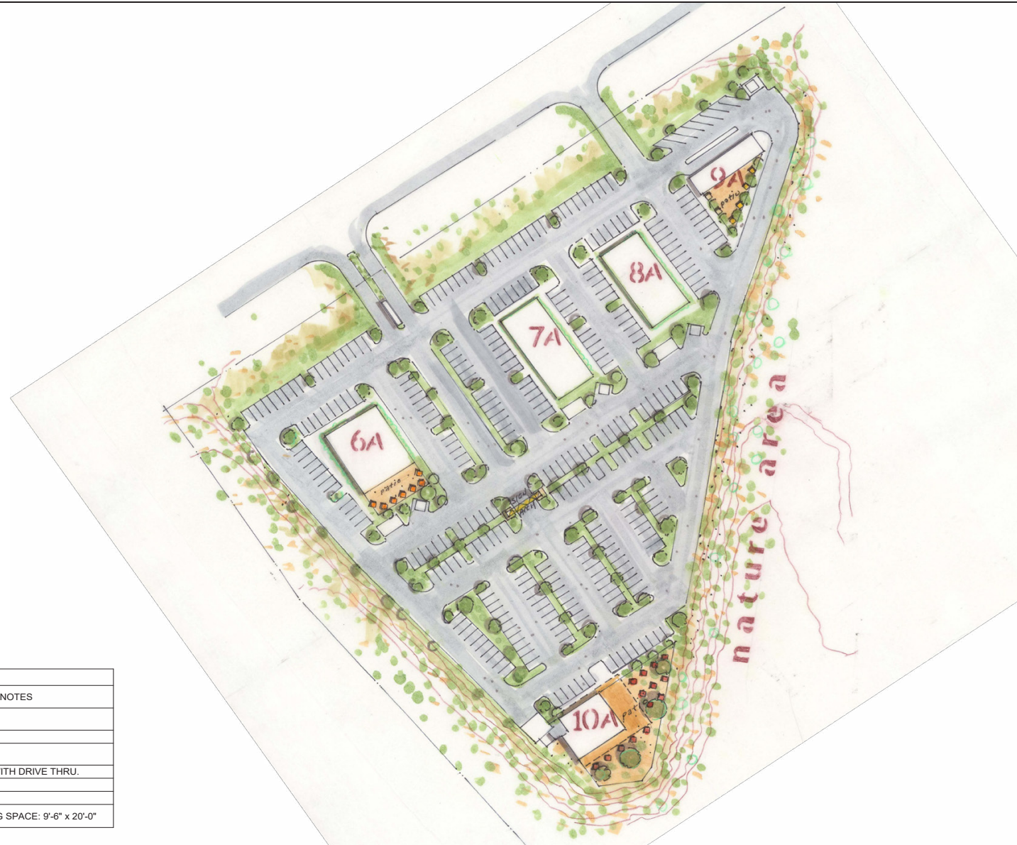
COMMERCIAL SUMMARY TABULATIONS